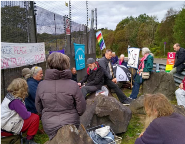
Meeting for Worship at Faslane on 29 th September, with a number of NFPB members present after their meeting in Edinburgh the previous day.