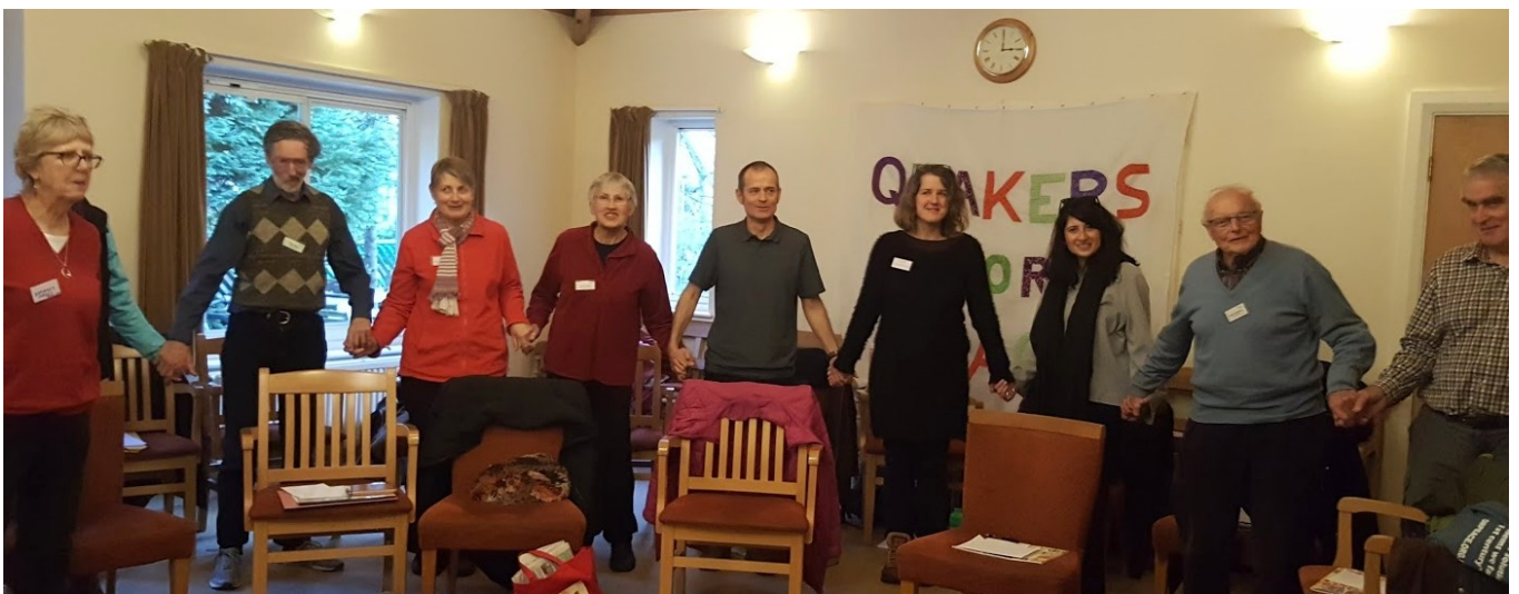
NFPB members at our meeting in Leeds in November

We find ourselves writing at a time of greater challenge still, in the midst of the Covid-19 pandemic. At such times, we know that we need our F/friends and we need our visions. Thank you for both and for so much more.