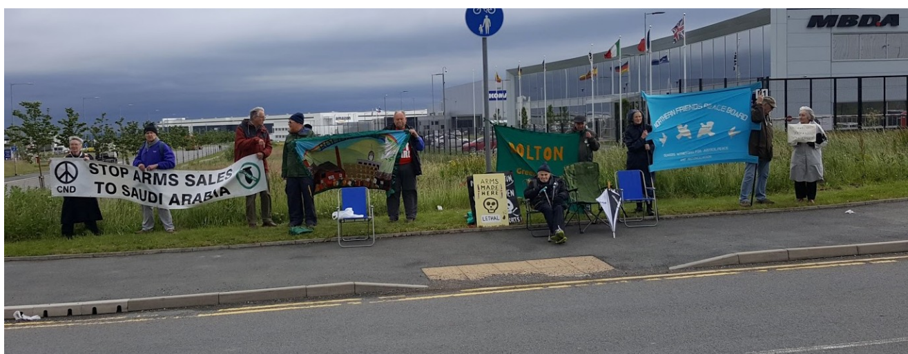
NFPB members at a vigil at the MBDA weapons factory near Bolton

Our links with other parts of the Quaker world continue to work well, with cross-representation with QPSW and our involvement with the Peace and Service Consultation of FWCC Europe and Middle East Section. We were well represented at Britain Yearly Meeting and ran an interest group meeting on nuclear disarmament issues.