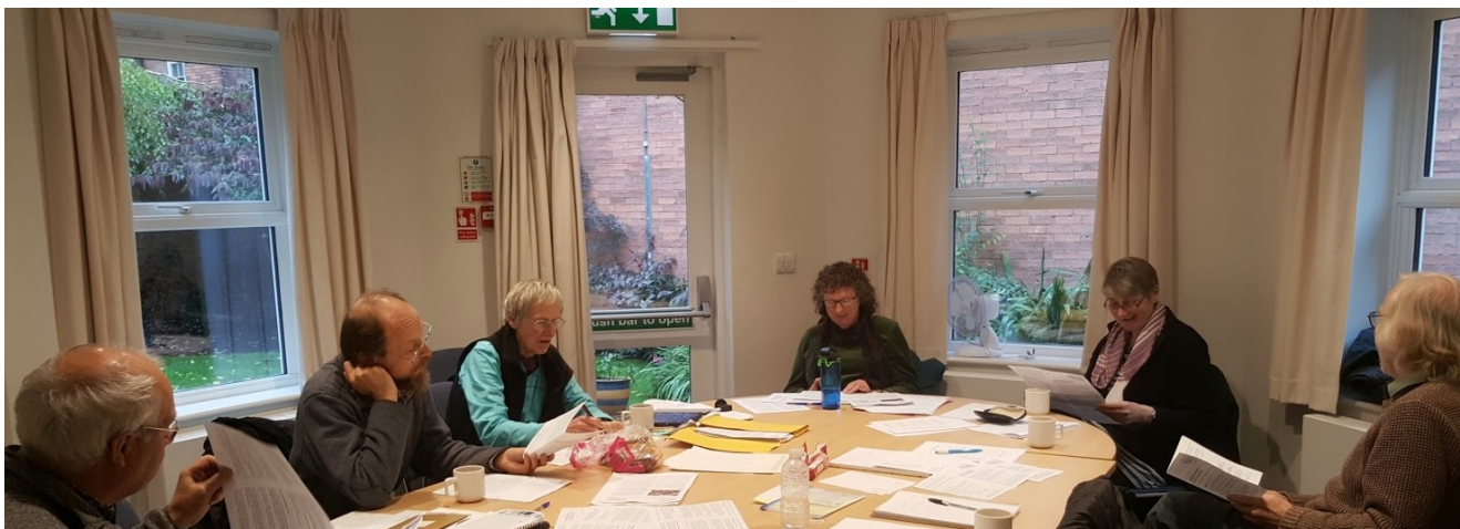
NFPB trustees at a meeting in York

Meeting, reports for representatives to take to their Area Meetings, plus responding to a range of enquiries and requests for materials. As well as the new 'Peace Round-up' of relevant news, comment and resources and our NFPB Updates, we sold and distributed a range of resources and materials. As part of the website improvements, we added an online shop, donations facility and a blog section.