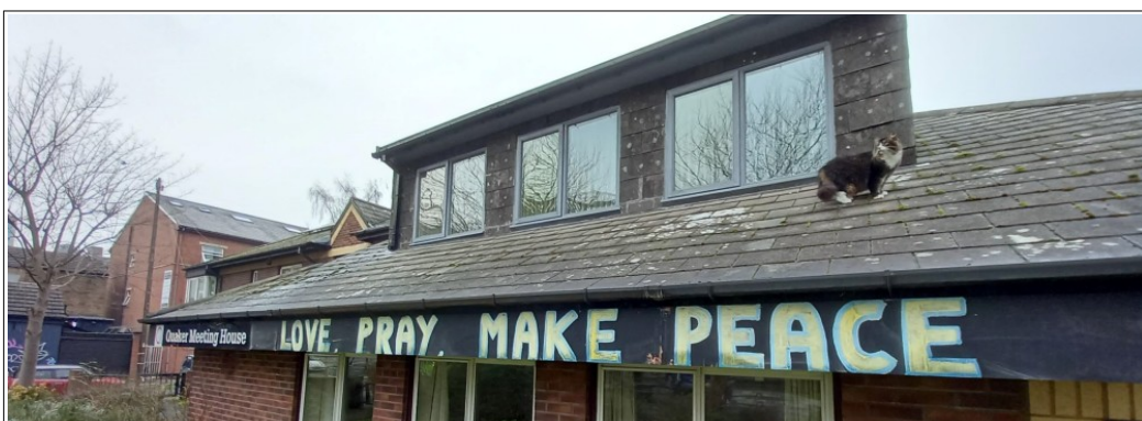
Image of signboard at Central Leeds Meeting House

The meeting closed in a period of stillness.